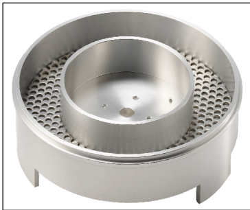
Figure 1: Shear Cell, Inner Catch Tray and Outer Catch Tray

The established scientific method for predicting potential powder hang-ups (both stoppages and blockages) is to use a shear cell (see Figure 1) to test the powder beforehand. The shear cell contains the powder which is compressed and then sheared by the test instrument. (See Figure 2) This test method establishes how much friction there is between the powder particles in order to resist movement relative to each other. The resulting data gives a picture of powder strength at increasing consolidation stress (see Figure 3), which correlates with the fill levels for the powder within the bin.