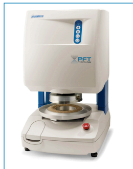
Figure 2: Brookfield Powder Flow Tester